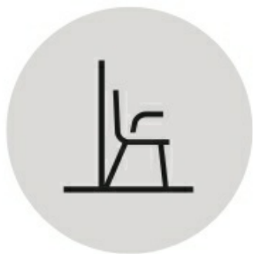
the product does not touch the walls