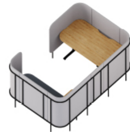
LPE SN3 + LP HR