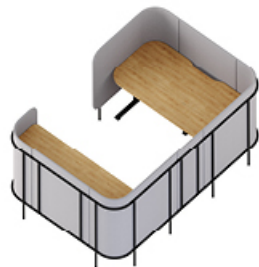
LPE MN1 + LP HR