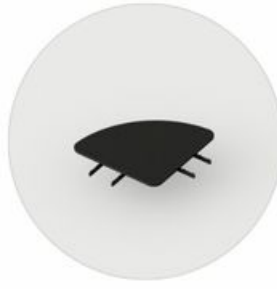
LE LC TB 90