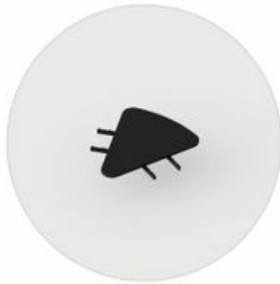
LE LC TB 45