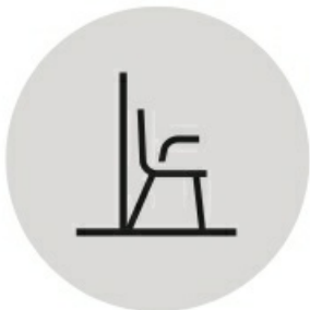
the product does not touch the walls