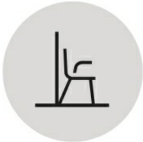
the product does not touch the walls