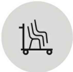
stacking on a trolley