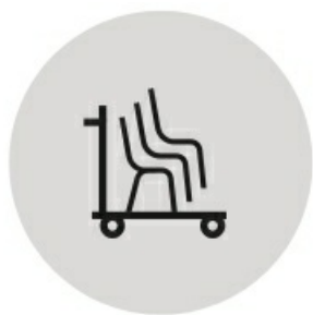
stacking on a trolley