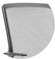
light grey mesh

A breathable membrane only on the backrest of the armchair? Forget it. With the Ovidio you will feel convenience of using it all over the surface. Thanks to this inconspicuous armchair will surprise you from the first use.