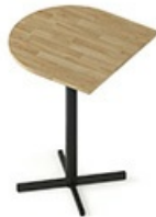
TB CSC 80H